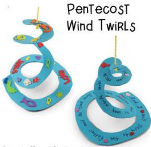
Pentecost Wind Twirls

This will remind you that the Holy Spirit is with us even when we can't see him