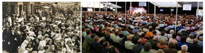
Conventioners - then and now

You can watch any of these when they are first broadcast, or catch up later on YouTube - all details are on the website