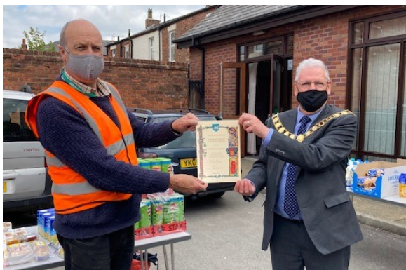
The Mayor of Preston visiting the Food Market at St Stephen's and awarding us with a Preston Coronavirus Community Hero Award